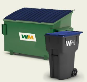
DO NOT INCLUDE: FOOD OR LIQUIDS PLASTIC BAGS OR FILM FOAM CONTAINERS CLOTHING, FURNITURE, OR CARPET BATTERIES ELECTRONICS HAZARDOUS WASTE YARD WASTE

Place recyclables directly into your recycling cart - Don't bag your recycling materials.