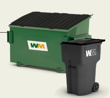
DO NOT INCLUDE: ORGANICS/RECYCLABLES HAZARDOUS WASTE ELECTRONICS BATTERIES, TIRES, OR PAINT FLAMMABLE MATERIAL