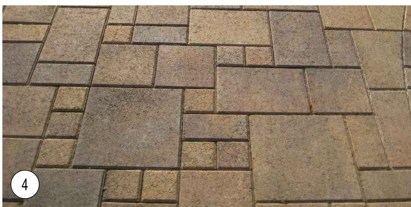
*Conceptual images (provided herein are conceptual and subject to change)