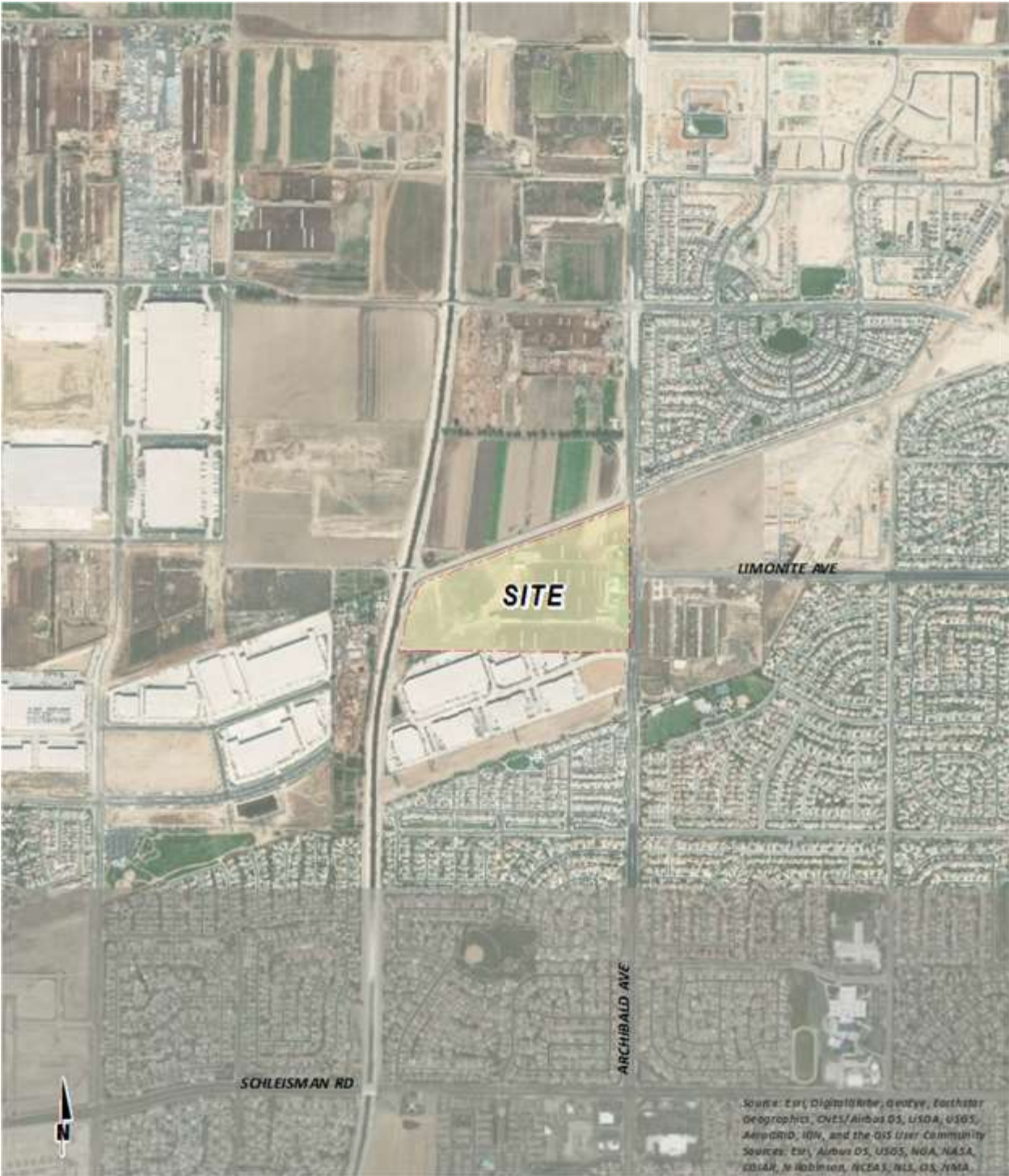
EXHIBIT 1-A: LOCATION MAP